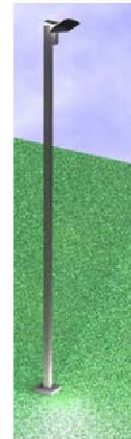
Shown on optional 15' pole